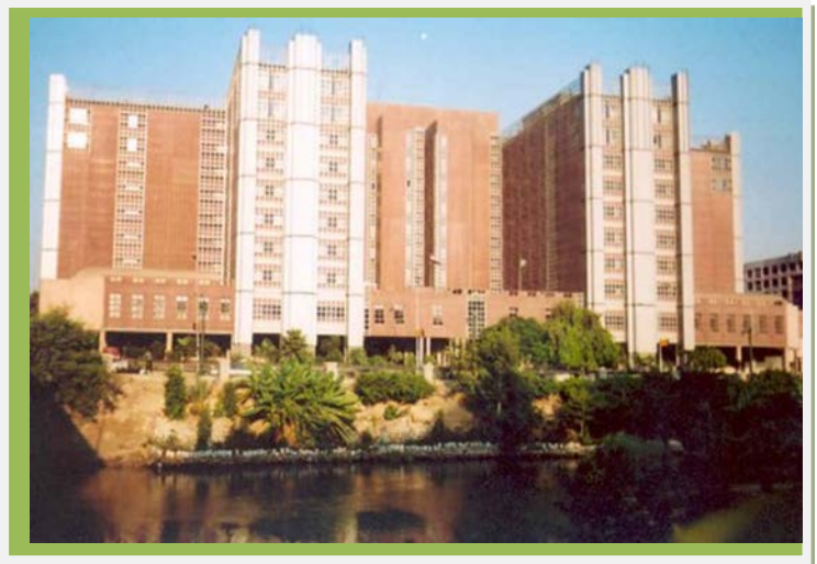
New French kasr el Aini hospital

Strive not to be a success, but rather to be of value ..Albert Einstein