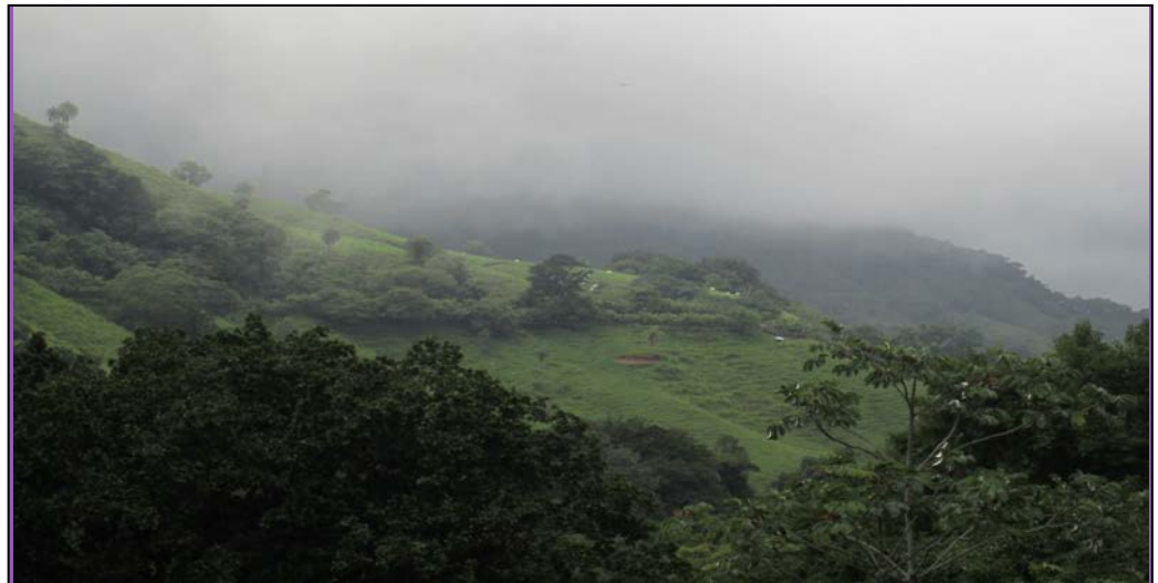
Rain moving in from the Pacific.