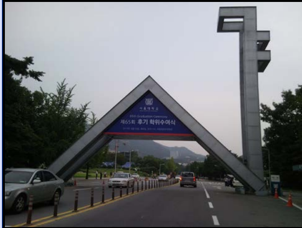
Seoul National University's (SNU's) Front Gate Entrance

The final product of this course is the final written report on our findings.