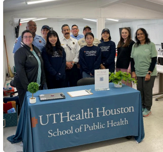
Study Team at Baseline Sampling Campaign

Or email us directly at: TFCS@uth.tmc.edu