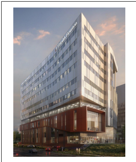
TFCS Research Symposium NEW UTHealth Houston School of Public Health 1930 Old Spanish Trail, Houston, TX 77054

The TFCS Scientific Advisory Board (SAB) reported strong recruitment progress, with approximately 550 firefighters enrolled and discussions underway about expanding the IRB-approved target beyond 700 participants due to strong interest. Other updates included the ongoing development of personal air samplers, advancement of the cancer registry linkage and cancer screening promotion studies, and continued outreach efforts. The SAB emphasized the importance of IRB compliance, stronger data tracking through dashboards, strategic planning for future funding opportunities, and development of publications that position TFCS as a scalable national model. Additional discussions focused on staffing and visa-related hiring challenges, lab relocation efforts for the new UTHealth Houston School of Public Health, and preparation for upcoming milestones, including the TFCS Research Symposium scheduled for October 8, 2026.